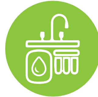
INDEPENDENT R.O. SYSTEM