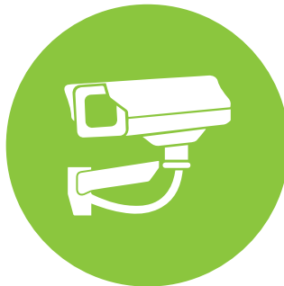
CCTV SURVEILLANCE CAMERA