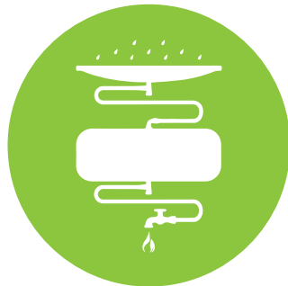
RAIN WATER HARVESTING SYSTEM